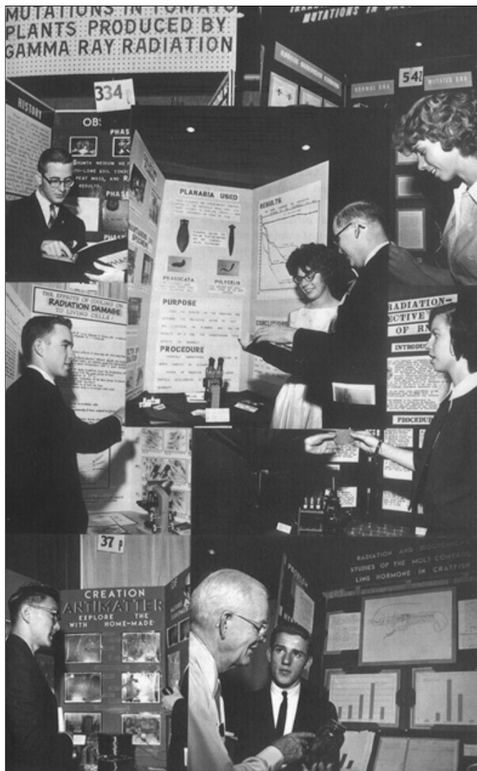
Contestants at the 14th National Science Fair International in 1963, photographed while their nuclear-related exhibits were being judged.

The promise of the future lies in the hands of the dedicated and the educated. A most significant part of that promise lies in the field of science. I would invite the earnest young men and women who are prepared to study and work hard to join in the exciting and rewarding profession of science and the scientist.