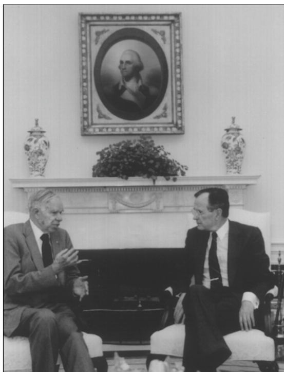
Glenn Seaborg briefing President George Bush on “cold fusion” at the White House on April 14, 1989.

—(End of the Skeptical Inquirer interview section)—