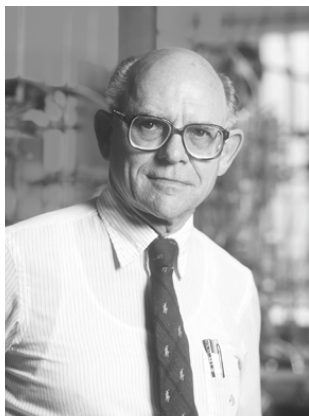
Distinguished Prof. F.A. Cotton, A signer and major promoter of the Petition.